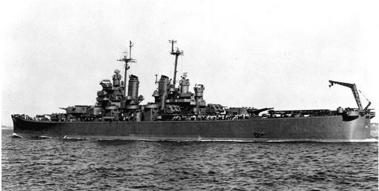
USS Helena - the first ship to receive the Navy Unit Commendation.

"That's our ship right there behind there," he said, pointing out photos.